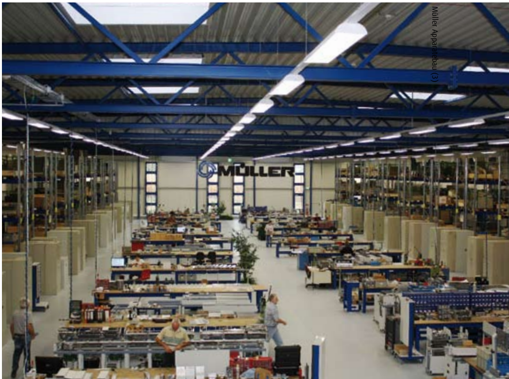
Müller Apparatebau (3)