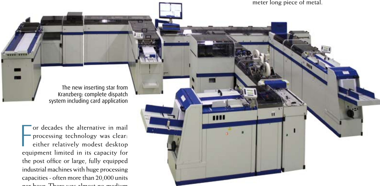
The new inserting star from Kranzberg: complete dispatch system including card application

An analogy to the automobile market suggests itself here: Previously there were also only well-equipped luxury and modestly equipped compact cars. In the past few years, the new classes of 1's or A series by the premium manufacturers have arrived and since then, fabulous equipment can be driven without having to look for a parking space to fit a five-meter long piece of metal.